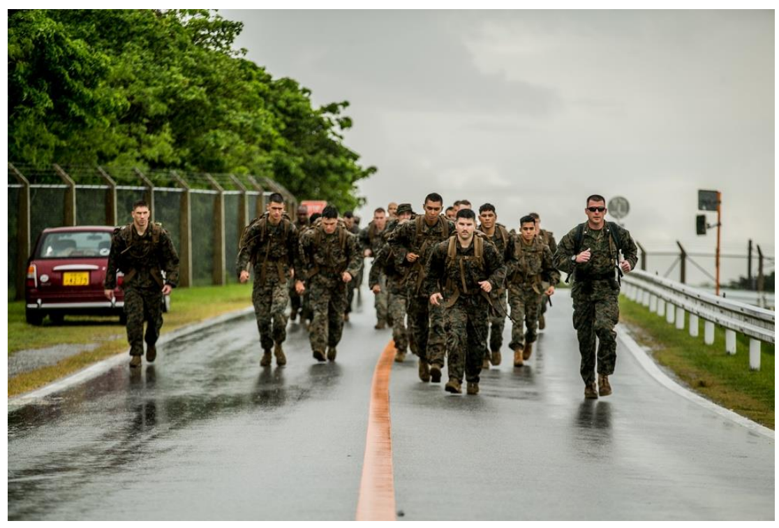
If it ain't raining, we ain't training