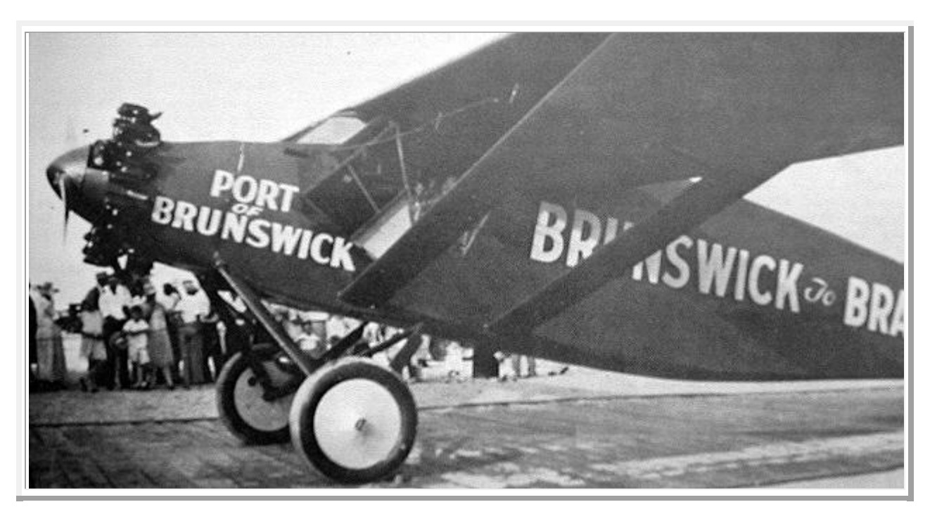
A very large group of observers and supporters gathered to watch the departure of the Stinson SM-1 from a runway on the beach at Sea Island, Ga.