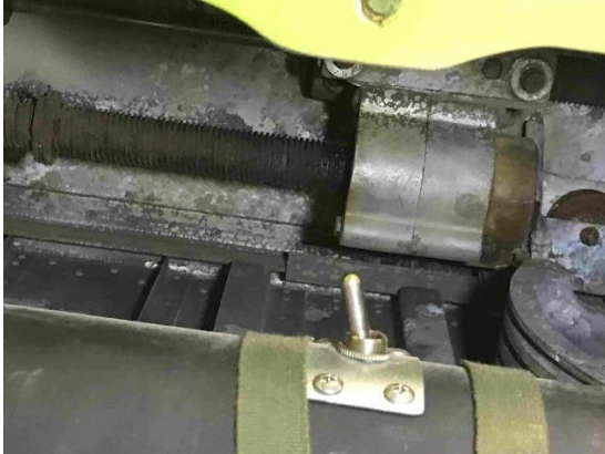
Gear shaft located on roof above aileron controls.

mechanical emergency lowering system is used when failure in the hydraulic system prevents lowering the wing flaps in the normal manner....The emergency system is operated from the radio operator's compartment....The gear shaft with which the crank shaft engages, is located on the shelf immediately above the stowed position of the crank. The crank is inserted in the housing, and, when this is done, the spring-loaded dog is pushed back, and the slots in the crank shaft engage with a pin in the gear shaft."