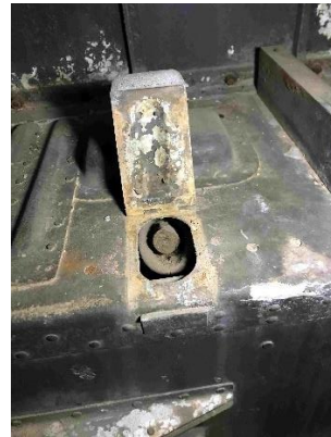
Housing for crank shaft