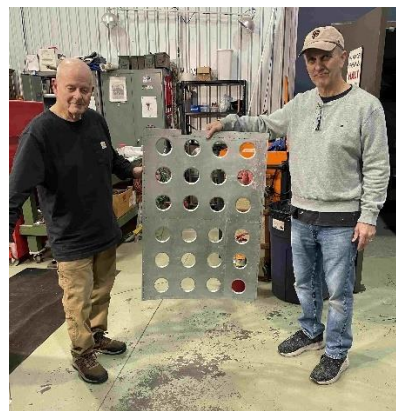
Completed inner skin