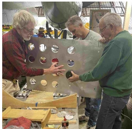
Cutting the holes in the inner skin

The gang has been steadily working on the half size bomb bay doors for GF2. The holes for the inner skin have been cut. One of the doors is now completely taken back apart and is being painted. Once each of the individual pieces are cleaned, primed, and painted, reassembly and riveting will begin! What took months to painstakingly cut and assemble, took less than an hour to take apart! We can't wait to see the finished product!