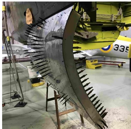
Completed door prior to disassembling