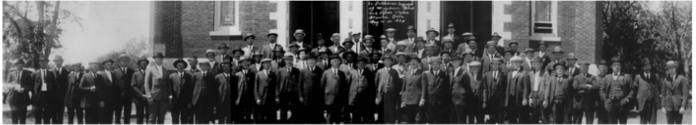
OKLAHOMA DISTRICT OF THE LUTHERAN CHURCH - MISSOURI SYNOD 1924 - 2024