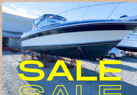
I986 WELLCRAFT ST. TROPEZ - $12,900

The majority of the museum's operating budget comes from the sale of donated boats and other items. This year we have expanded our program to include cars! Our inventory is low. Please consider the museum when deciding how to dispose of a boat or vehicle that you no longer need. We can pick up the vessel or car and provide the necessary paperwork for tax purposes. Your contributions greatly help the local community and our beloved museum. Please email us at donations@rfmuseum.org for more information on how to donate or to inquire about our current inventory!