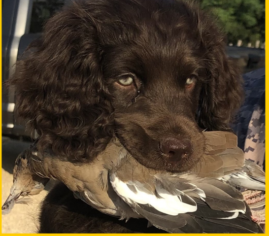
This year's Photo contest

Please feel free to visit the canine health information center website for more information concerning health and genetic testing at <a href="https://ofa.org">https://ofa.org</a>.