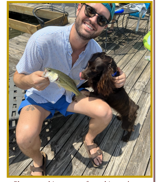
Photos on this page are from this year's contest. Don't be left out next year!

The BSCBAA Slogan: "...dedicated to all the things you do with your Boykin Spaniel."