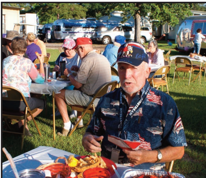
Ohhh...it's Good! Outdoor Picnic