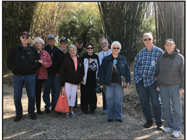
Above...Part of the group touring Jefferson Island Below...enjoying Crawfish and more! .. at Crawfish Town