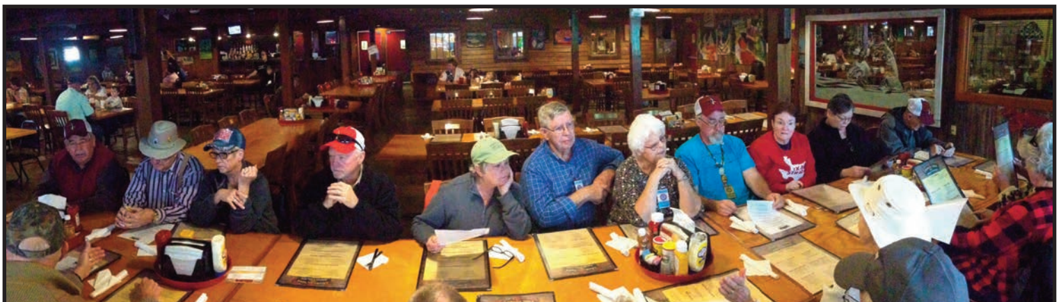
What's a trip to Cajun Country without a stop for some true Cajun food and a whole lotta Crawfish, Etouffe, fish & more!