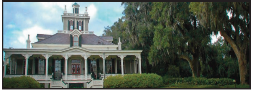
A mysterious place, Jefferson island is haunted by the legend that Jean Lafitte, the pirate, buried his treasures under the giant live oaks that would later shelter a home and garden