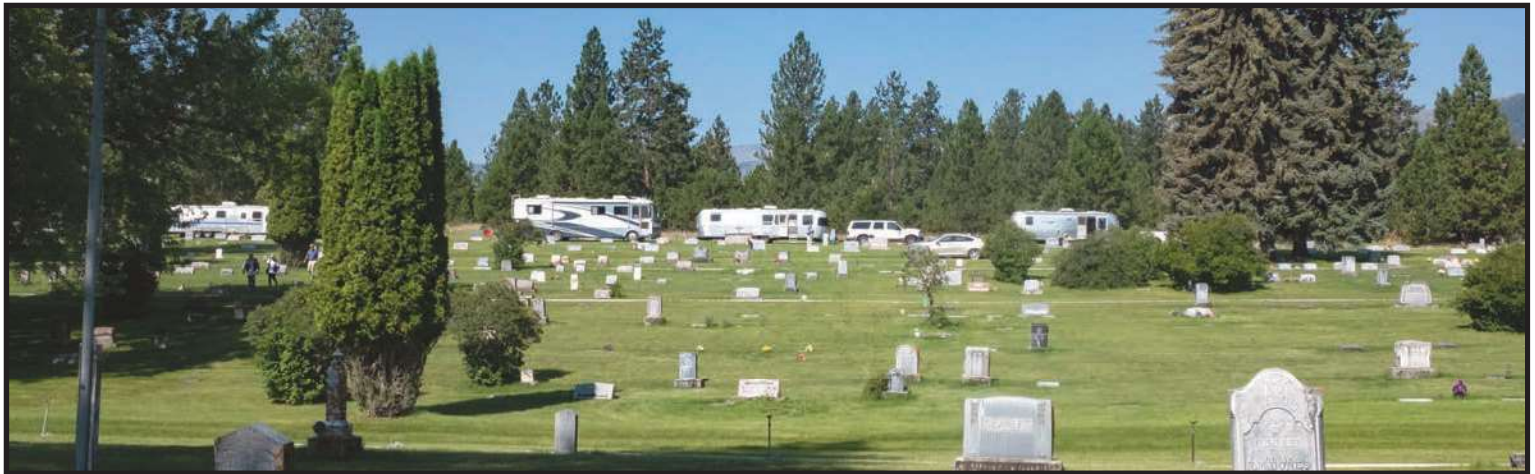
Stretched out across the cemetery...Texas Gulf Coast Unit members caravanned over 2000 miles to pay Tribute to their friend Gordon Babbitt