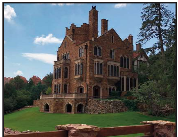
Yes...there is a castle in the United States..Glen Eyre castle in Colorado next to the Garden of Gods..