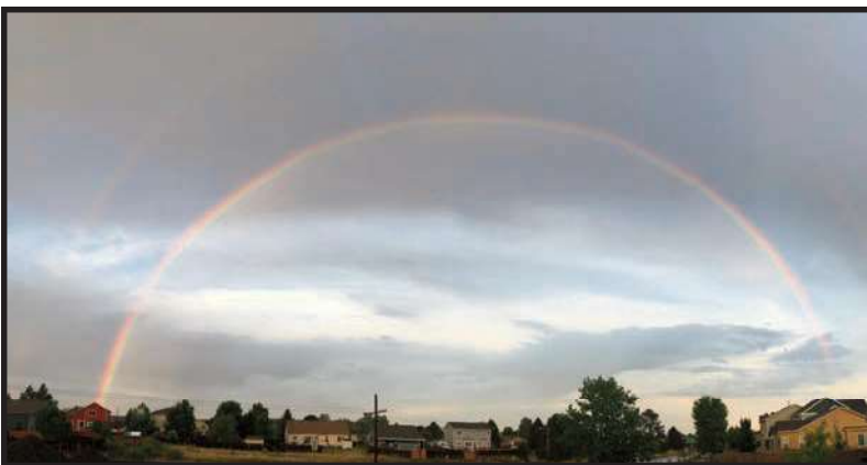
Following a light rain in Colorado Springs A rainbow stretched completely across the sky...Note the second rainbow above..