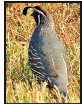
A Montana Quail ... couldn't escape Paul's Camera