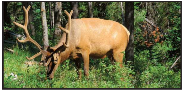
Wyoming wildlife...a Bull Elk and Big Grizzly in Wyoming