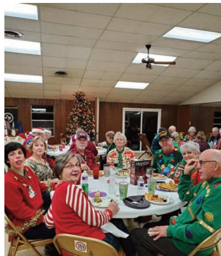
Christmas Pot Luck Dinner & Ugly Sweater fun