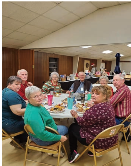
The Cooks and Hosts for the Installation Dinner