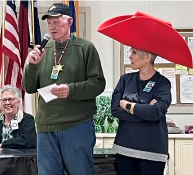
The Sheriff & His Deputy's Report