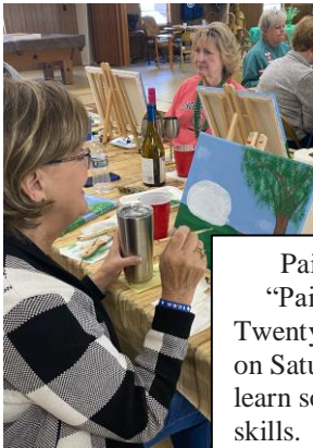
Painting Party— "Painting by Cory" Twenty ladies gathered on Saturday afternoon to learn some painting skills. What fun!!