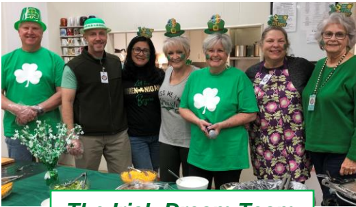
The Irish Dream Team

Notice the progression of expressions—especially from sweet RuthAnne in the background!