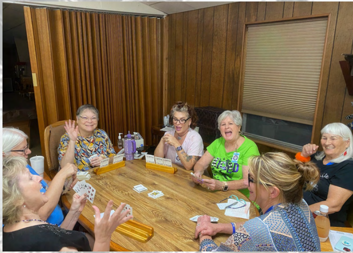
FUN TIME PLAYING CARDS