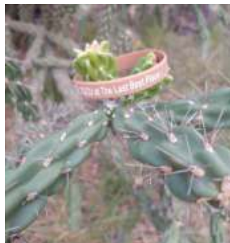
BIG BEND - SELINA & STEVE SHADD