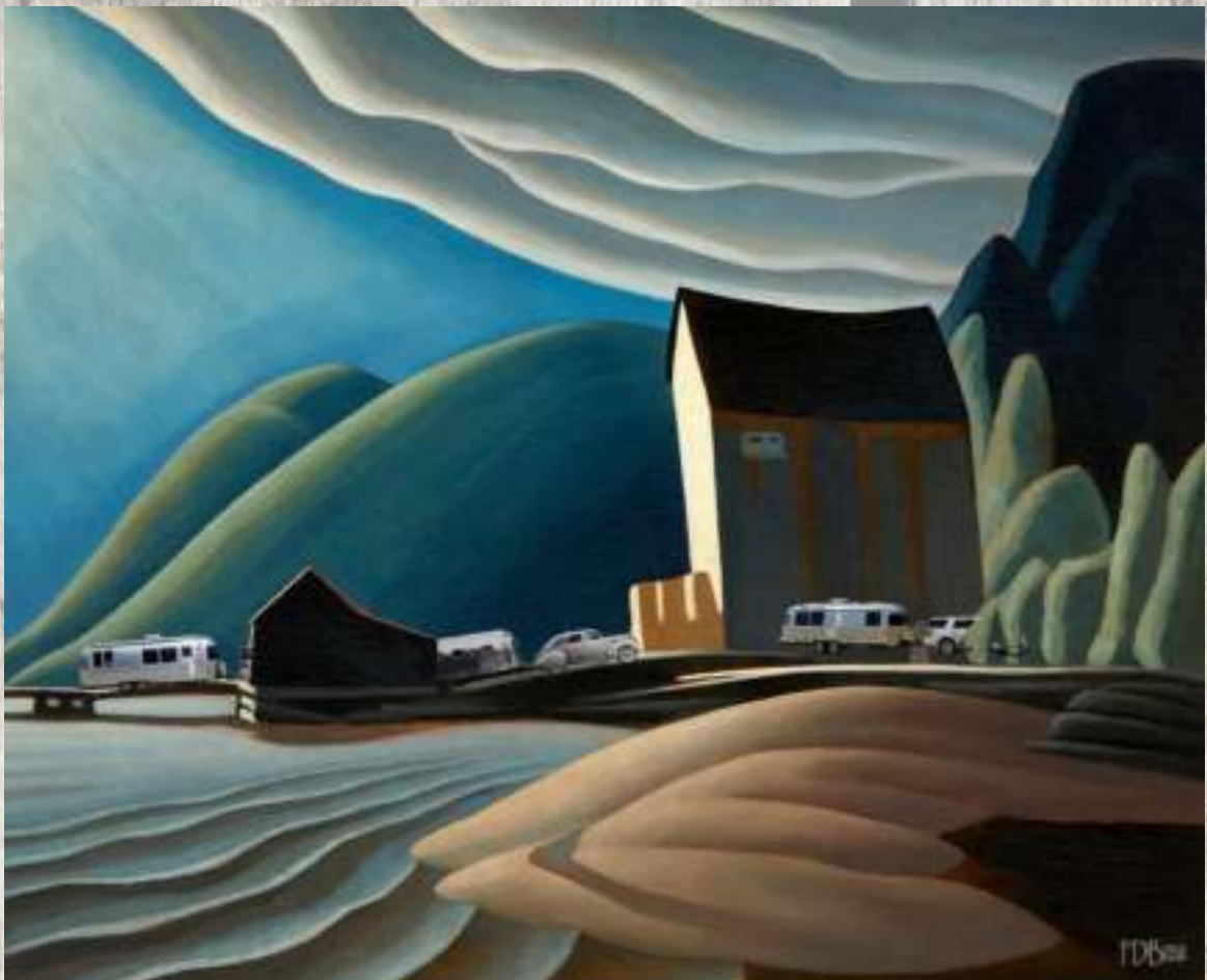
AIRSTREAM ART BY FRANK DIBONA