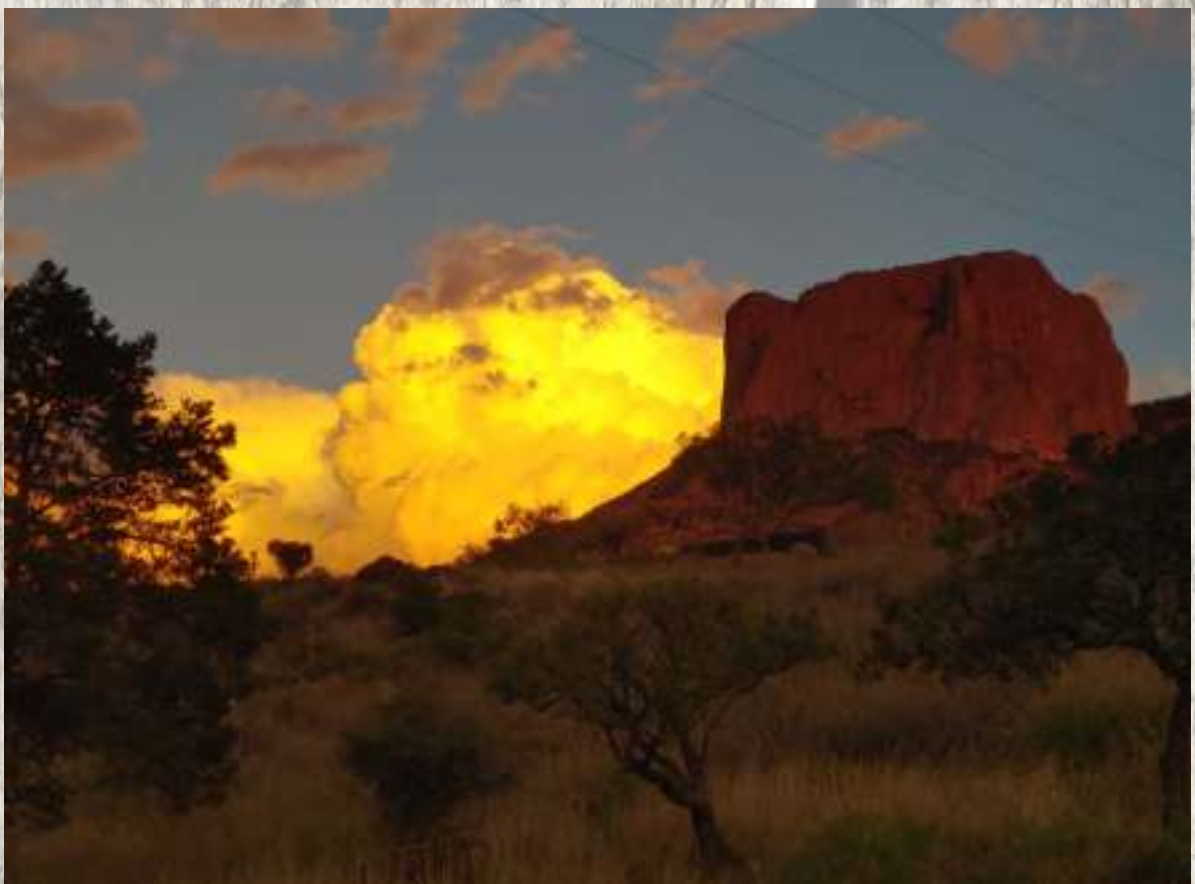
CASA GRANDE AT SUNSET BIG BEND NATIONAL PARK