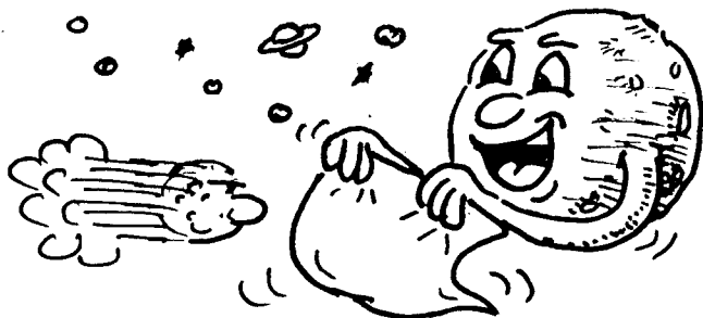
Approximate date and time of comet fragment impact

WANTED: The old CARA banner. Last seen at a FIELD DAY several years ago. If you know where it is please call, N2DVX at 438-6782.