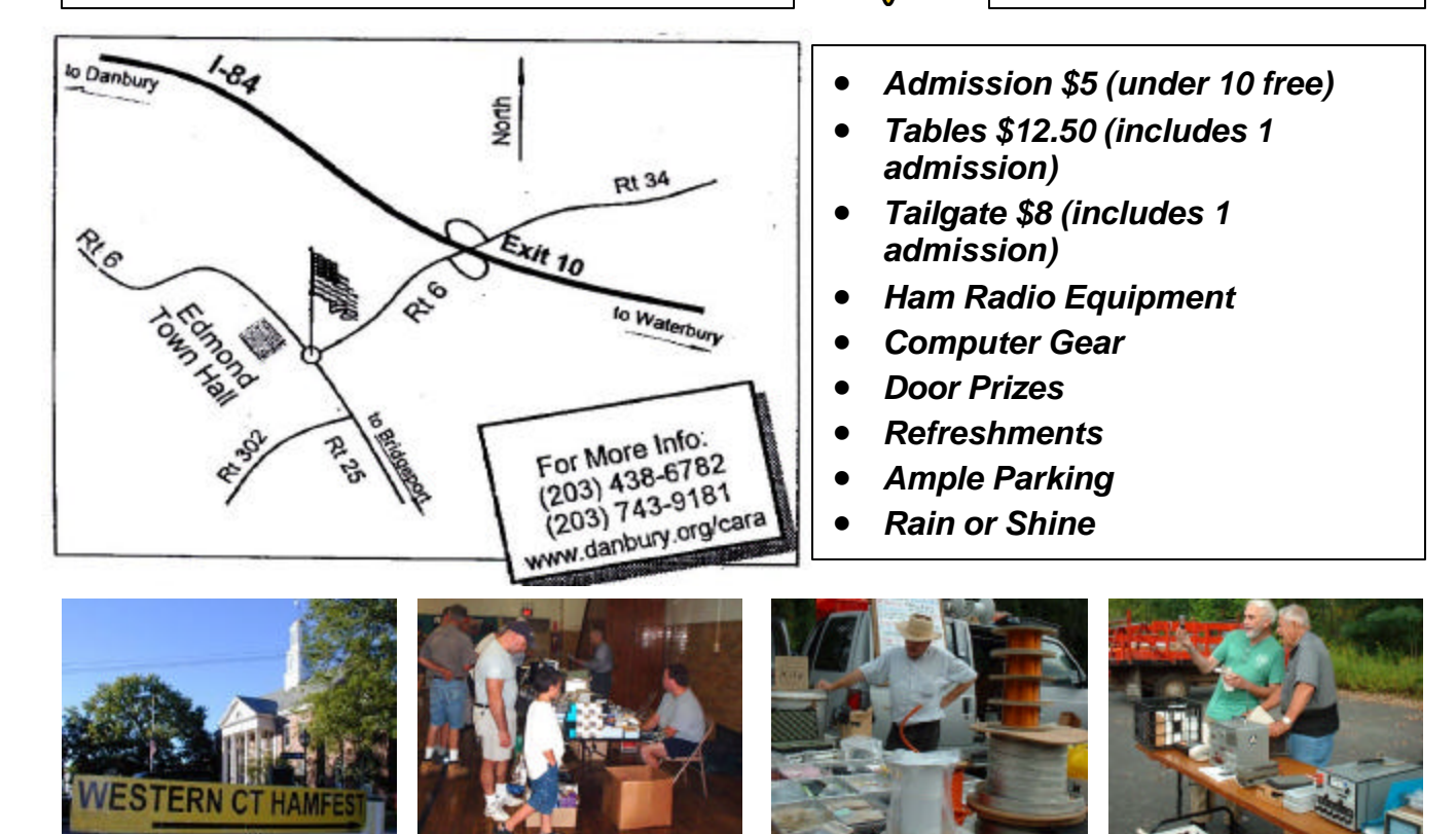
Candlewood Amateur Radio Association (CARA) Hamfest, September 14, 2003 c/o John Ahle – W1JMA, 120 Fire Hill Road, Ridgefield, CT 06877