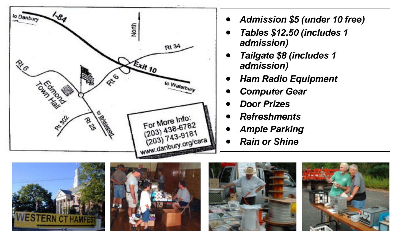
Candlewood Amateur Radio Association (CARA) Hamfest, September 14, 2003 c/o John Ahle – W1JMA, 120 Fire Hill Road, Ridgefield, CT 06877