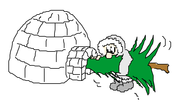
Happy Holidays to All...