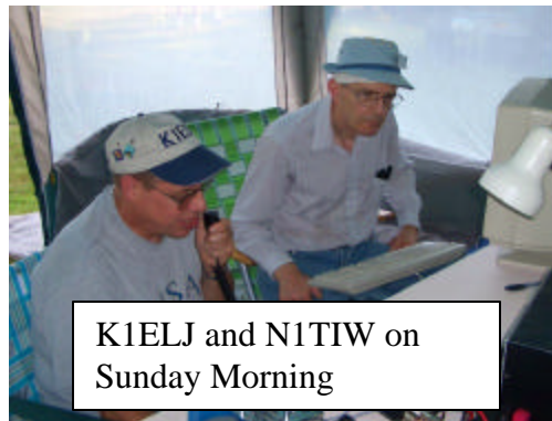
K1ELJ and N1TIW on Sunday Morning