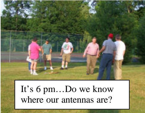
It's 6 pm...Do we know where our antennas are?