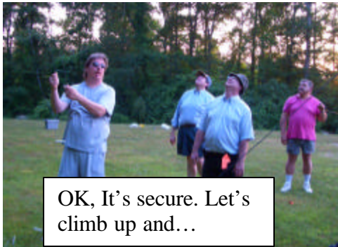
OK, It's secure. Let's climb up and...