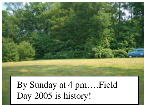
By Sunday at 4 pm....Field Day 2005 is history!