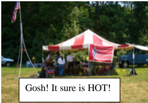
Gosh! It sure is HOT!