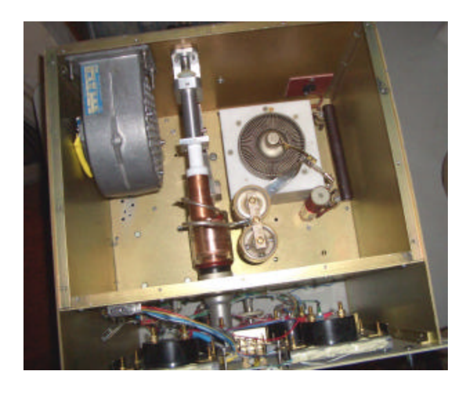
Top view of 6M amplifier that was converted from 13M to 6M.