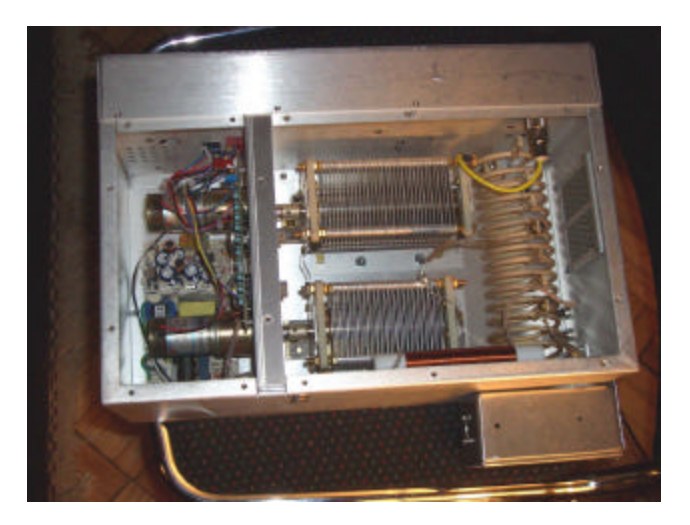
Close-up of RF matching network showing stepper motors.

Close-up of a liquid-cooled microwave power generator.