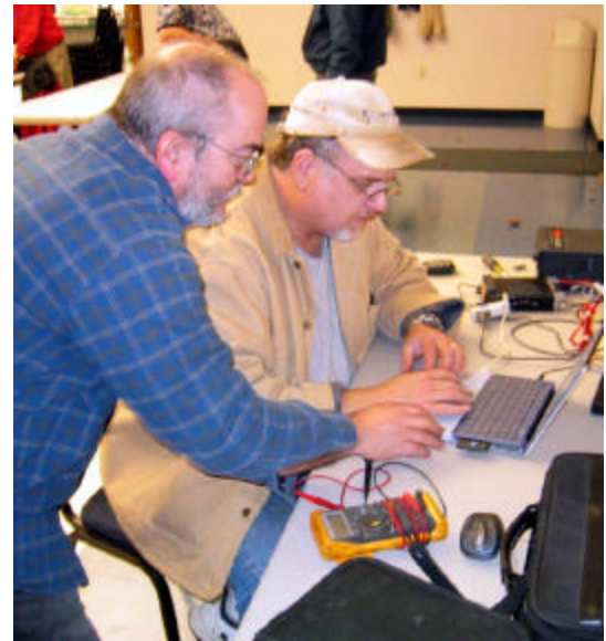
haven't come to a meeting yet since we moved to our new location, please stop by!

The October meeting was an opportunity for a little experimenting with "AirMail" – the digital messaging application. The Stony Hill Fire Department has proved to be a great location for our meetings and activities. If you