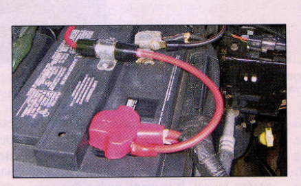
Figure 2 — Connections to the vehicle battery. Note the heavy fuse holder on the positive lead.

Packet, Airmail and AX.25 packet.Printing capability.