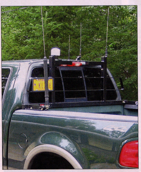
Figure 1 — My latest ham radio platform, just waiting for the next trip.