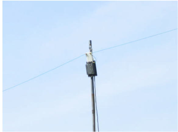
120-foot dipole and antenna tuner