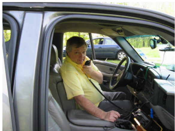
KD1DD at the mike