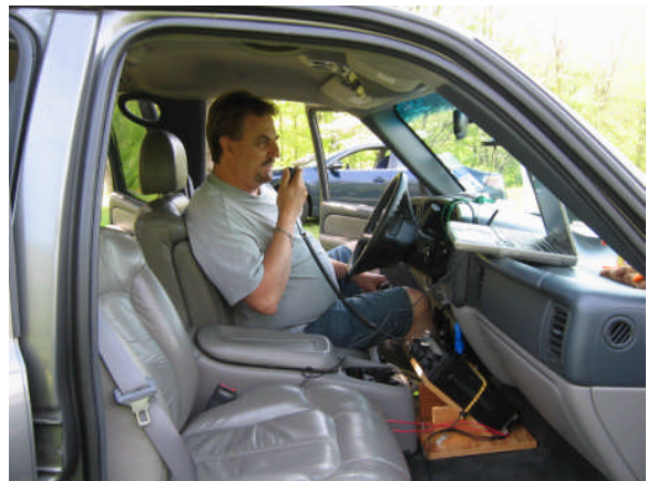
KD1YV on the air