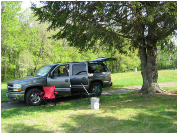
Mobile Operation at Putnam Park

Here are some photos they snapped of the field and their setup.