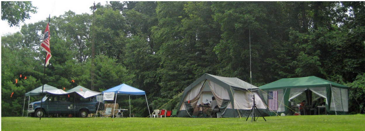
Meeting: Friday, July 9...Stony Hill Fire Station