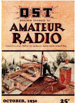
Some things don't change...

We have no place to store large quantities of material so loans of items or pictures or electronic media are acceptable.