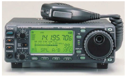
We've come a long way!

This celebration will be going on during the rest of 2011 so if you come across something let us know. Who knows, if we get massive amounts of stuff we may extend the Anniversary into 2012!