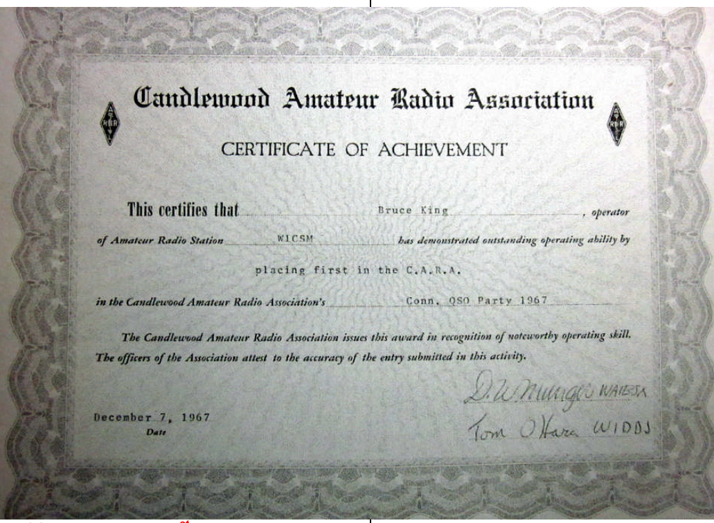
W1CSM certificate for 1<sup>st</sup> place in 1967 CARA-sponsored CT QSO Party. Signed by WA1BSX and W1DDJ.