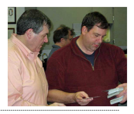
...And a reminder of the "Good Old Days..."