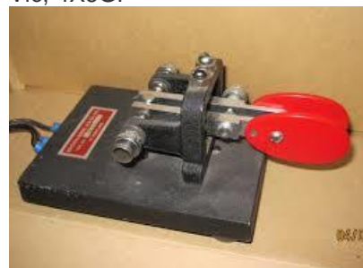
Brown Brothers Model BTL Keyer Paddle