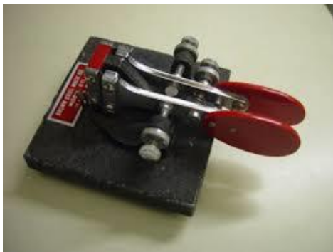
Brown Brothers Model BTL-A Keyer Paddle

Your antenna projects or other ham radio project pictures will be featured here.