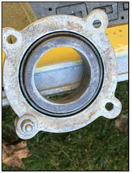
Original tower bearing

cleaning with mineral spirits and greased it up good - like I would do to re-pack a wheel bearing on a car.