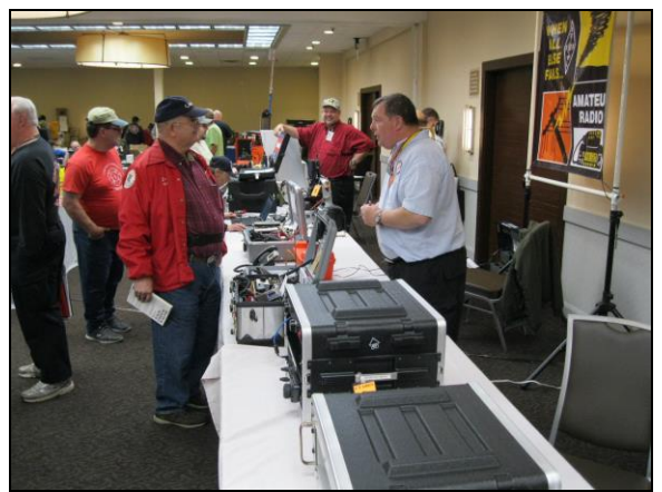
The Great 2016 CT ARES Go-Kit Competition - organized by WA1SFH