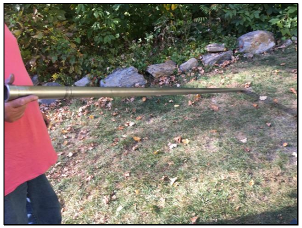
Stainless steel mast

I installed the bearing on the tower and also mounted the rotor in its position on the tower. The rotor control cable was routed through the back wall of my house to the HAM-IV rotor controller on my ham shack desk. Art and I went to town on the 9 ft. stainless steel mast with scotch-brite to make it look like new.