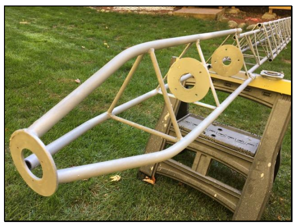
E-Z Way tower top section

We inserted the mast through the top of the tower though the bearing. We tried to rotate the mast by hand but the bearing was rubbing on the bearing housing which prevented the mast from turning.