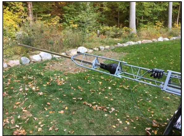
Original thrust bearing with rotator and mast installed.

The new bearing outside diameter is larger than the old bearing but luckily it just fit on the tower mounting plate. So now, the trick was to perfectly center the new bearing on the mounting plate and drill new mounting holes. This turned out to be more difficult than I thought it would be, due to clearance issues with the tower structure and the existing holes in the bearing mounting plate. After wearing out my drill bit and a trip to Lowes in Danbury to get another bit, we got the bearing mounted dead center. (Ed note: This type of thrust bearing is designed to run dry. DO NOT use any grease.) Next, we slid the mast through the thrust bearing and clamped it in the rotor. I went down to the ham shack while Art staved with the tower as I used the HAM-IV controller to turn the rotor. Art reported back that the mast was rotating smoothly and without any wobble. Then we traded places so I could observe the mast rotation and I was absolutely thrilled with how well the mast was moving. That was a huge hurdle we had just overcome and now we could move on to actually mounting an antenna to the mast.