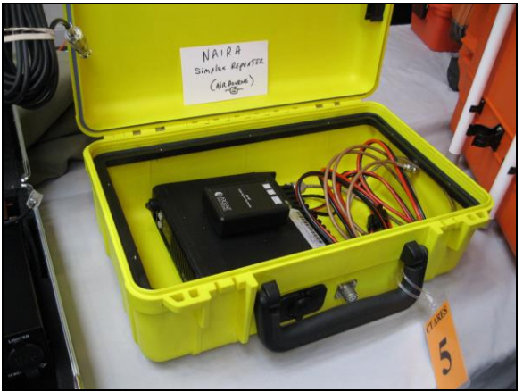
ARES Region 5 Airborne Repeater