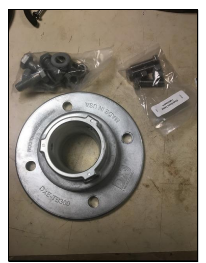
DX Engineering tower thrust bearing

At this point, I decided to scrap the old bearing and buy a proper thrust bearing for this application. Since this E-Z Way tower is old, and E-Z Way is out of business. I knew it would be difficult to find a suitable bearing. After researching the web, I found a thrust bearing used for Rohn towers of similar size on DX Engineering's web site. The bearing arrived two days after I ordered it, and when I unpacked it. I was amazed at how well it was constructed. I was convinced it would work great for my application if I could mount it to the tower in the same location as the original bearing.