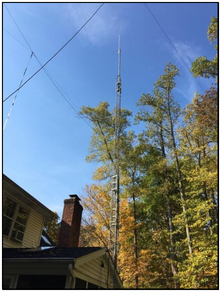
E-Z Way tower - cranked up for use with Diamond Dual-bander installed

Now that there was an antenna mounted to the mast, I had to put the tower in the vertical position and crank the tower up to its fully extended position. This was another first for the tower project. First, I tried the antenna on 2 meters with my Kenwood TS-711A radio. I had not been able to hit the PVRA Prospect repeater before, but with the tower and new antenna, I'm now able to hit this repeater as well as the New Milford and Woodbury repeaters. Whoopee! I then tried the 70cm radio and had similar results. And I should also mention that this was my first experience on the 70cm band and that was very gratifying.