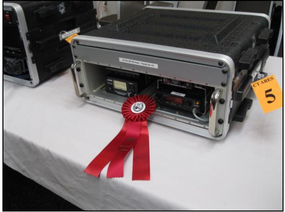
W1QK 2M FM voice & packet Go-Kit