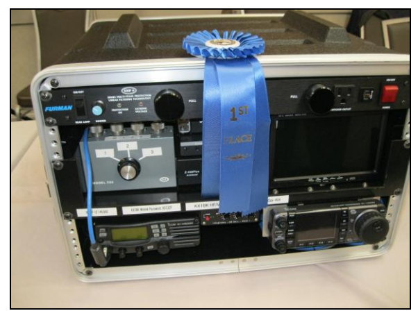
KX1BK HF/VHF Go-Kit, built by Brookfield EC, W1QK