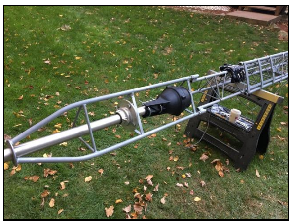
New thrust bearing with rotator and mast installed.

I was originally going to mount a Diamond 2 meter vertical to the tower that I bought at the Southington Ham Fest last year. But in the mean time, I acquired a Kenwood TS-811A 70cm all mode radio off the Internet so I needed to get a suitable 70cm antenna. decided to pick up a Jetstream dual band antenna at the Nutmeg Hamfest last month. I installed the new antenna to the top of the tower mast using a piece of cheap coax I had laying around. And now after 7 years of waiting to have an operational tower, I finally was able to put the tower to use. What a great feelina!