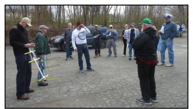
No-Jim, I'm not gonna tell you where the fox is hiding...

KC1JGV released all the hunters at 2:40 pm, then later joined Jay to await their arrival.