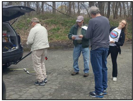
W1SMF, AB1JC, KD1YV & KC1JGV

CARA members and friends met on Sunday, April 29 at the Danbury Candlewood Lake Town Park boat launch parking lot on Hayestown Rd. for CARA's Spring Fox Hunt.