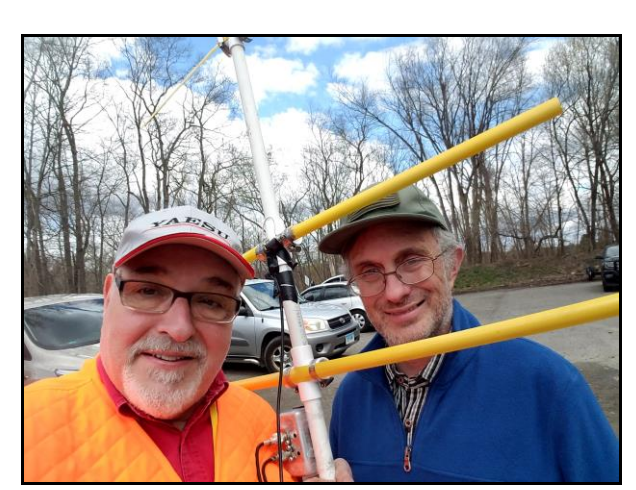
KC1IBR & KB1ZAC