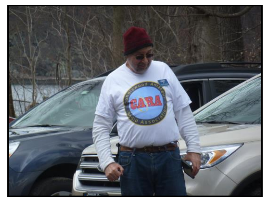
Jay-N1NRP "aka The Fox" meets with the hunters