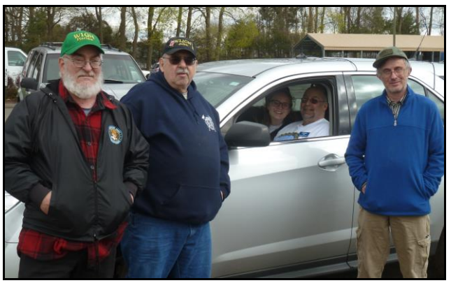
W1QH, W1JGM, KC1JGV, N1NRP, KB1ZAC

Both were very excited to finish in first place!