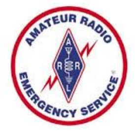
CT ARES News: