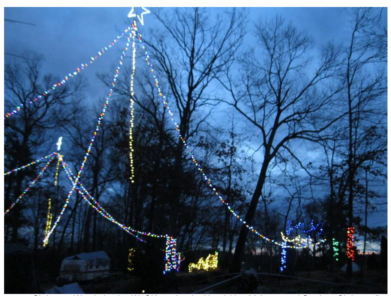
Christmas Wonderland at W1QK - as inspired by visiting "A Longwood Gardens Christmas"

Doors open at 7:30 for socializing and conversation. Meeting begins at 8:00 p.m.