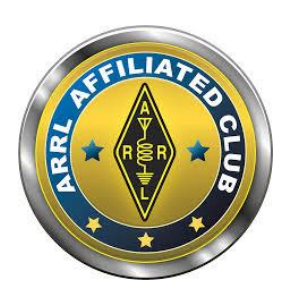
CARA has been an ARRL Affiliated Club - since 1946