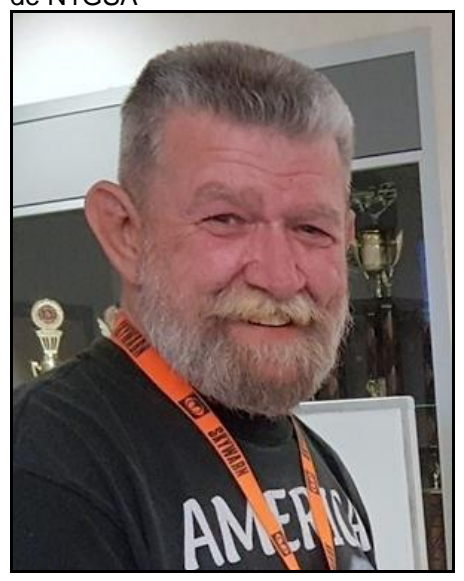
August 14 CARA Monthly Meeting Minutes de N1GSA

Meeting was called to order at 7:30 by Pres Bud Kozloff, W1NSK