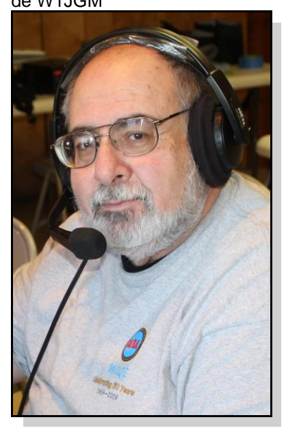
Vice- President's Message: de W1JGM

Welcome to the end of summer. Under normal times, I would be writing to thank everyone for their great effort and the fantastic success of our annual Hamfest. Unfortunately, this was not to be, as with many other events that were required to be cancelled.