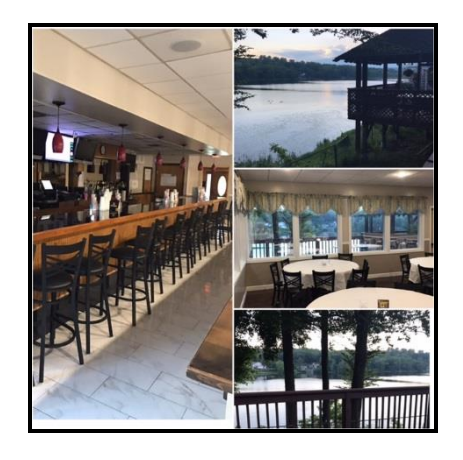
Second Annual CARA Summer Pasta Party – July 16, 2019