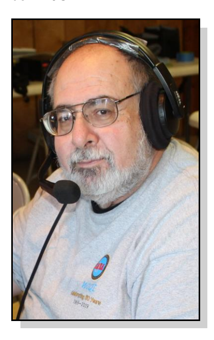
Vice- President's Message: de W1JGM

There's a chill in the air, the leaves are turning, and I can smell the evening smoke from neighborhood fireplaces and woodstoves for the first time this fall, which means that October has arrived.