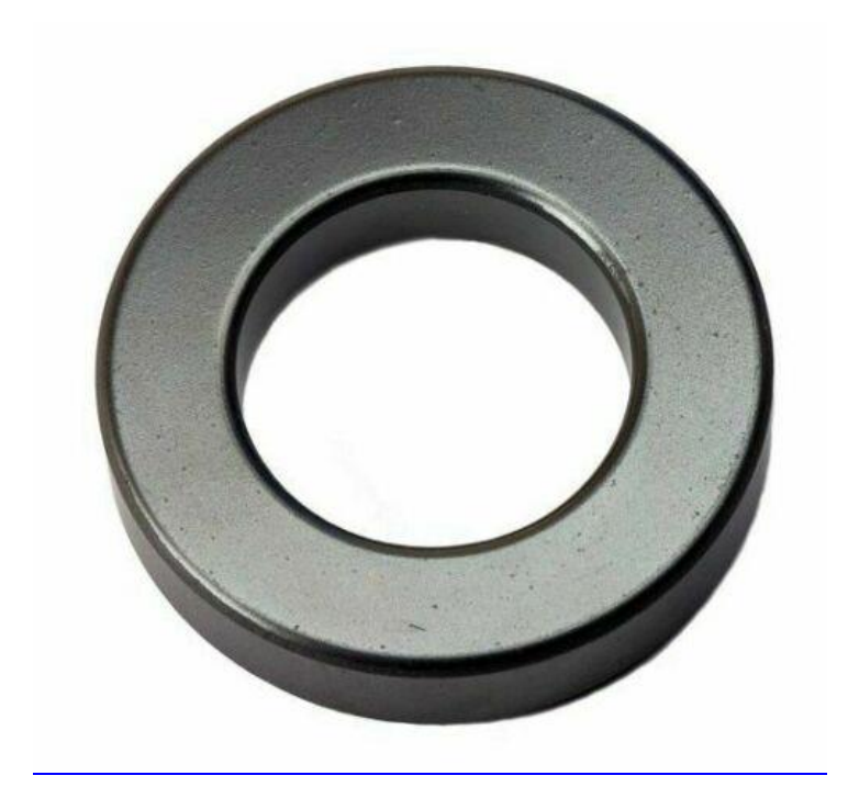
FT-240-43 FT240-43 Toroid Core | Large | 43 Material

W1QK's project to eliminate portable generator hash. One effective use of toroids.