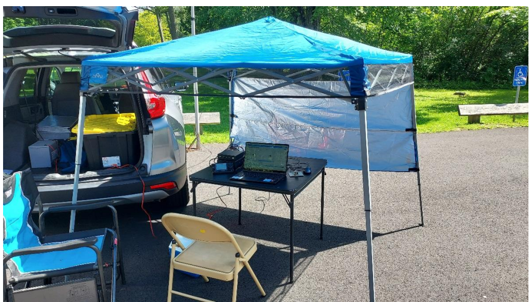
W1JMA's (and others) POTA canopy discovered by W1QH at BJ's Warehouse