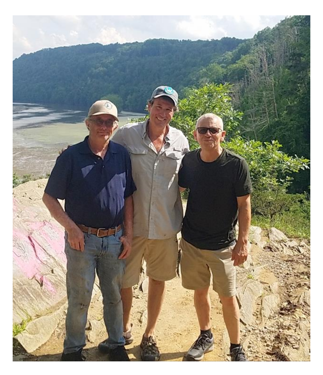
New Milford's Lovers Leap State Park overlook of Lake Lillinonah