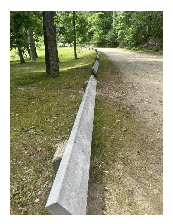
Papa Cat estimates that there's enough space to park to the side and lift a telescoping mast to support a 40M/20M Dual-Band Skeleton Sleeve antenna to make some POTA contacts. What do you think?