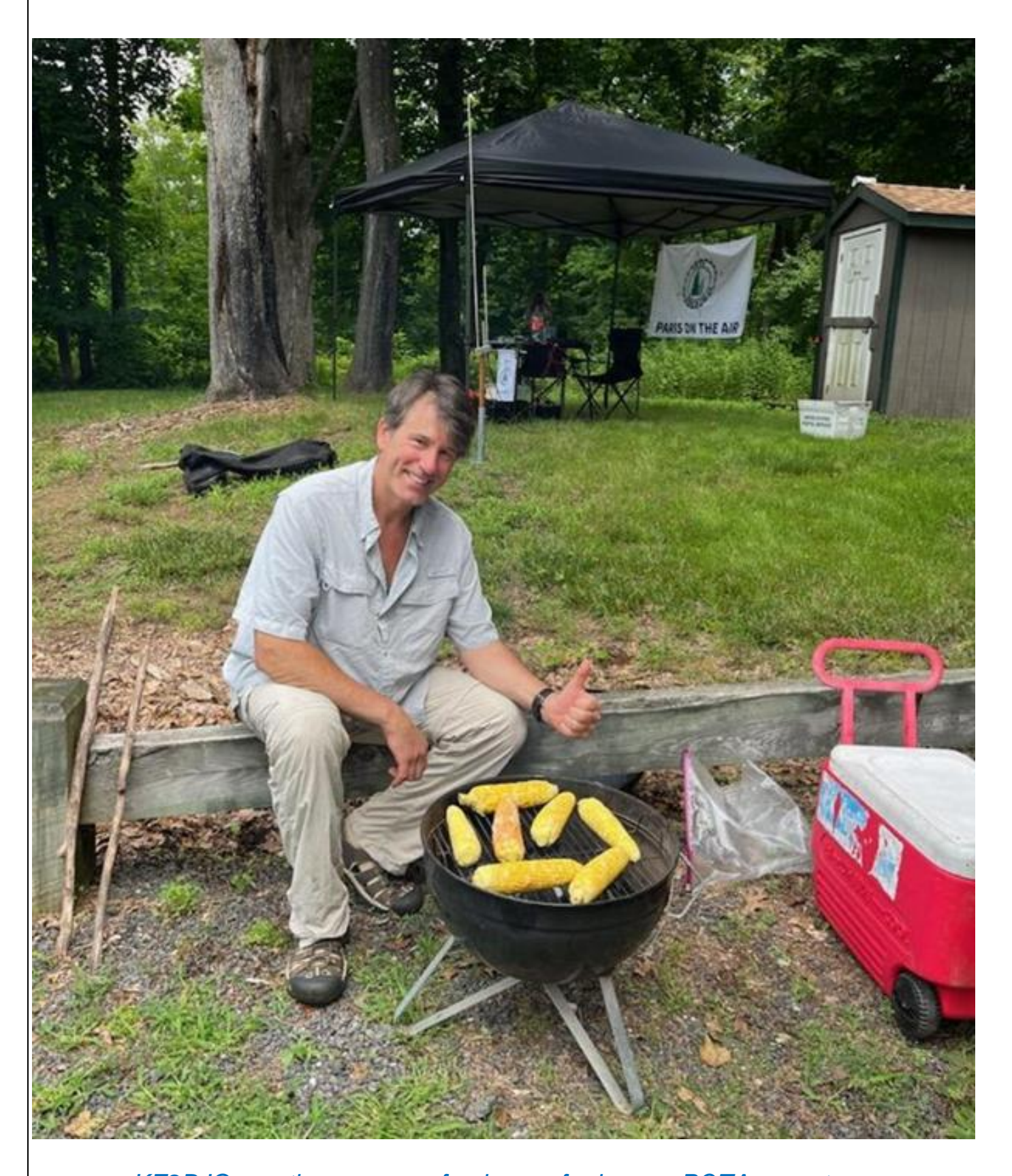
KE2BJG roasting up some fresh corn for hungry POTA operators