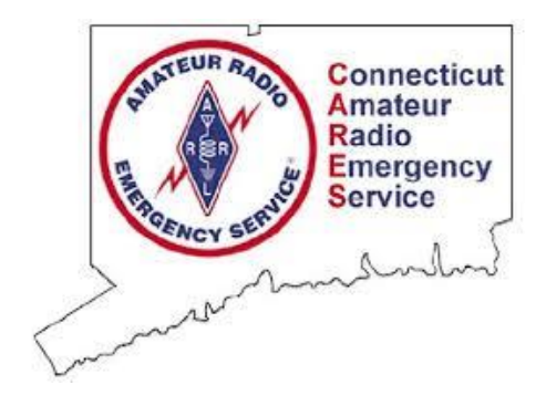
Next CT ARES Winlink Wednesday: Wednesday, March 1, 2023

The annual CT ARES Region 5 Simulated Emergency Test was held on Saturday, November 19, 2022. Thank you if you participated. Results and comments will be discussed during the next CT ARES Region 5 and CT ARES Region 5 South meetings.