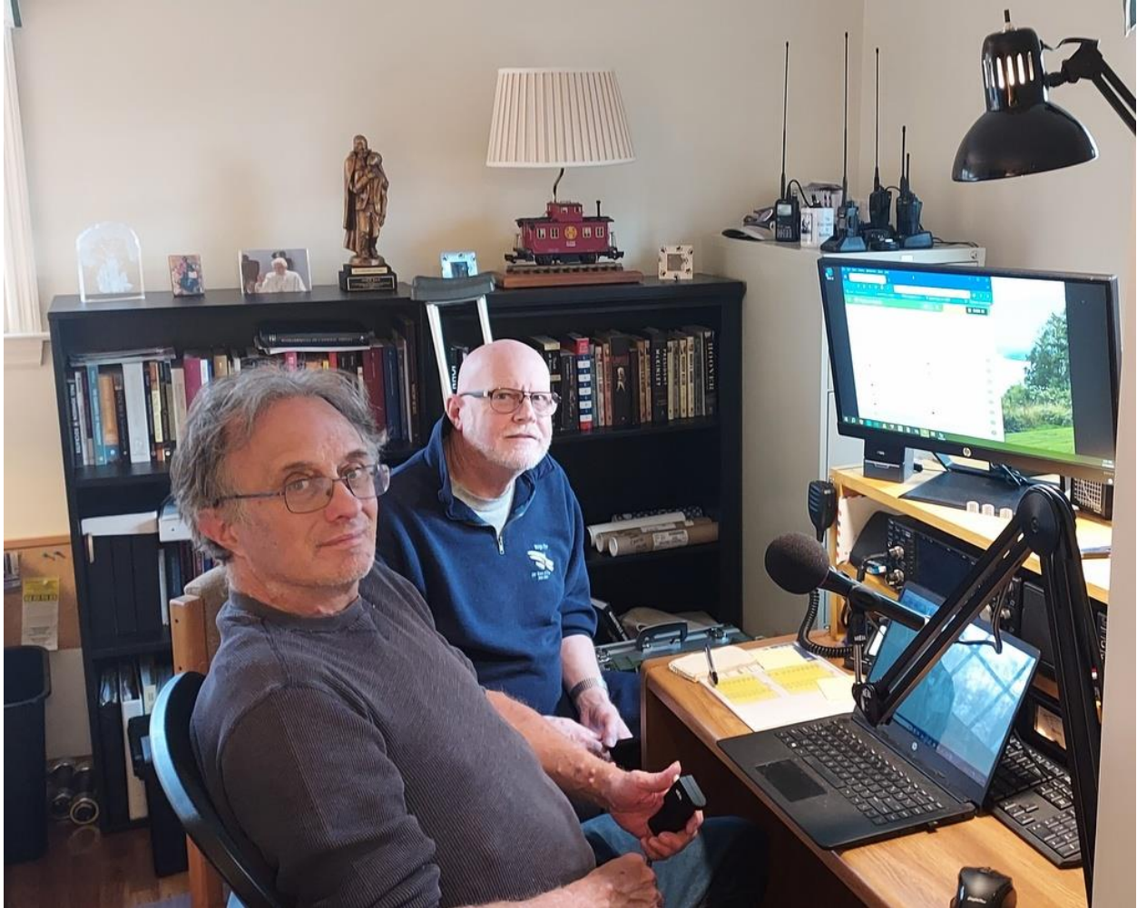
CARA Club Station Day at W1JMA