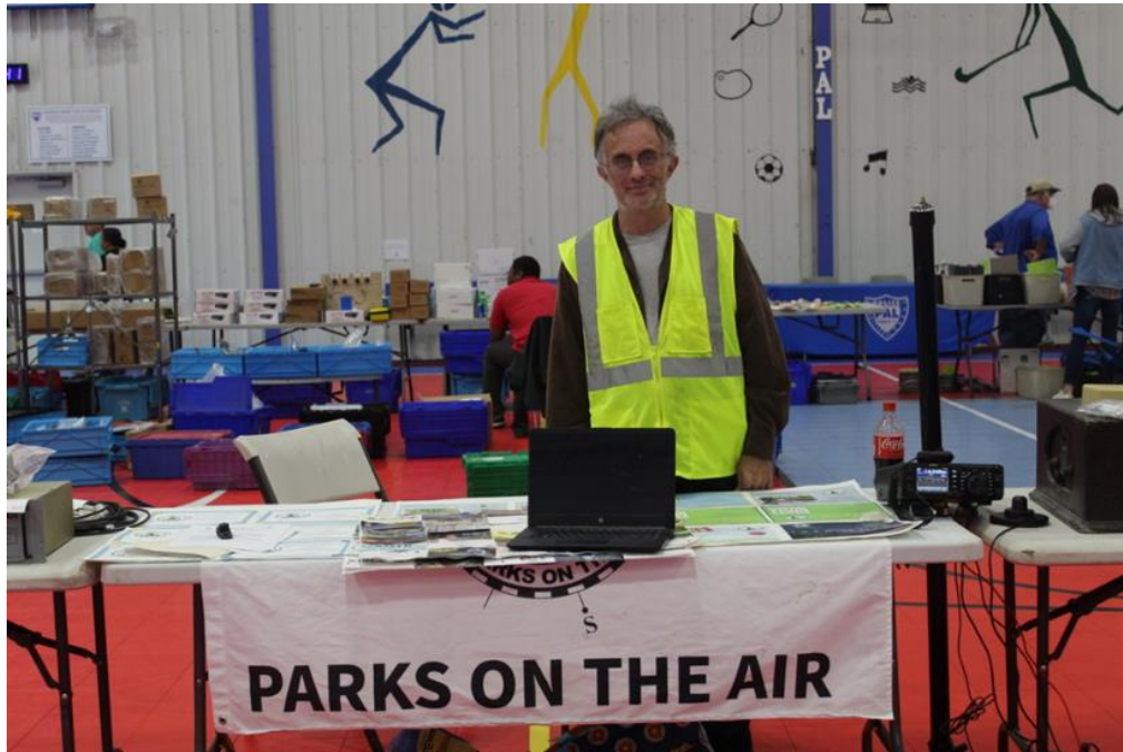
KB1ZAC promoting POTA at our CARA 2022 Hamfest.