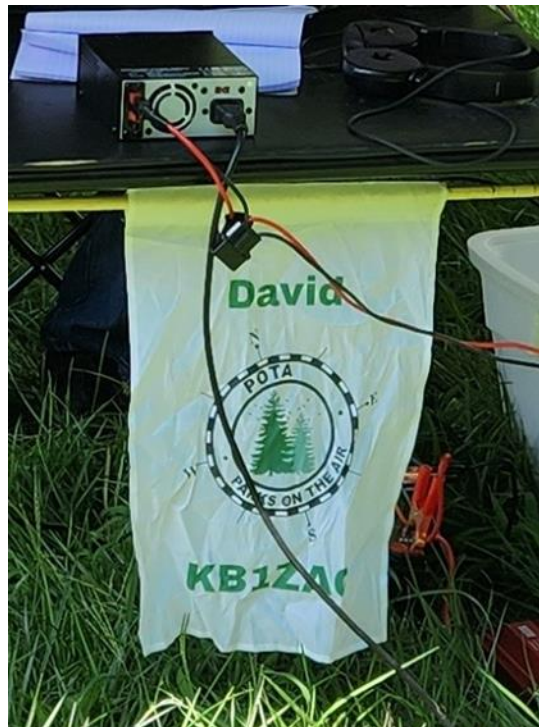
KB1ZAC at POTA Park K-1681 in New Milford.