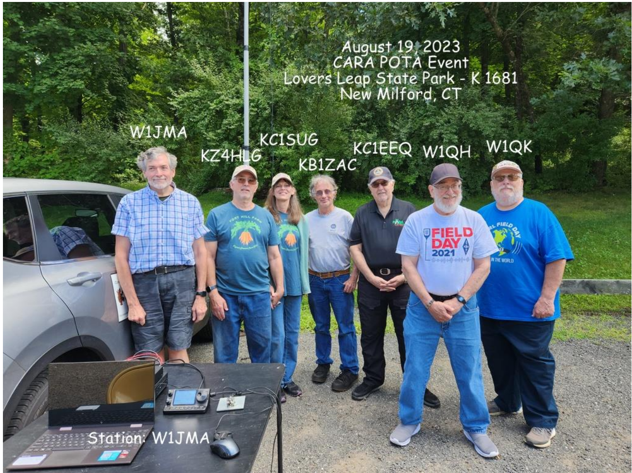
CARA POTA Event – August 19, 2023 at K-1681