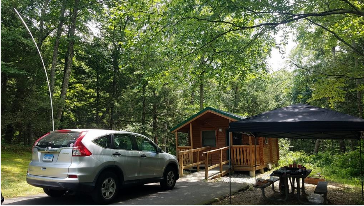
KB1ZAC at Kettletown State Park in Southbury.