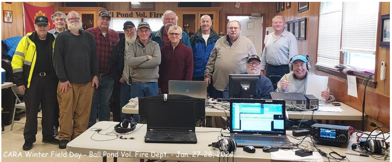
CARA Winter Field Day – Ball Pond Vol. Fire Dept. - Jan. 27-28, 2024

This in-person meeting will be conducted on Friday, February 9 at the Stony Hill Fire House on Stony Hill Rd. in Bethel (Rte. 6). Doors open at 7:00 pm, gavel at 7:30 pm.