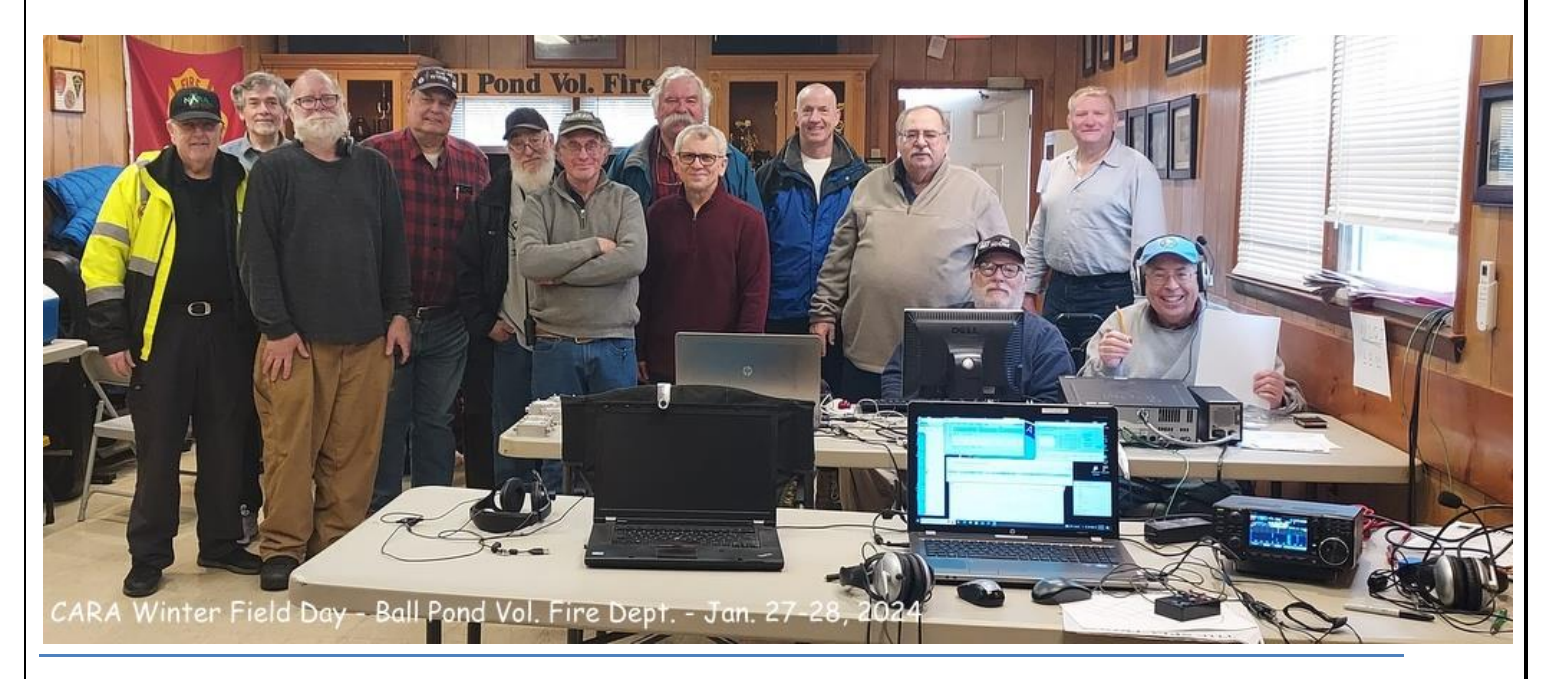
Review of CARA Winter Field Day: Jan. 27-28 Photos and score details begin on page 29.

This in-person meeting will be conducted on Friday, February 9 at the Stony Hill Fire House on Stony Hill Rd. in Bethel (Rte. 6). Doors open at 7:00 pm, gavel at 7:30 pm.