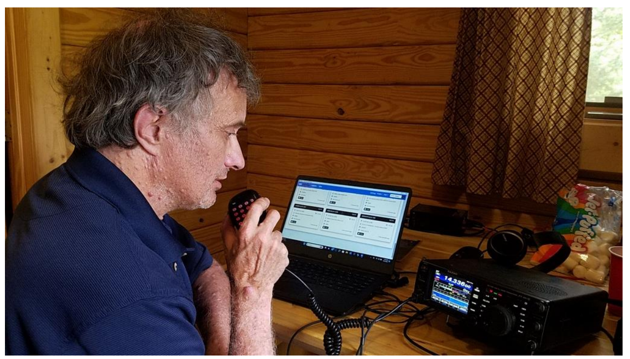
KB1ZAC: "Just a boy and his radio".