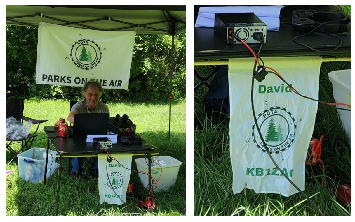
KB1ZAC at POTA Park K-1681 in New Milford.