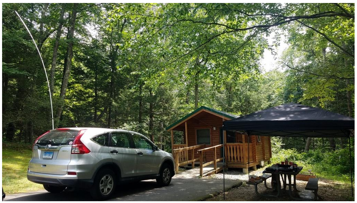
KB1ZAC at Kettletown State Park in Southbury.