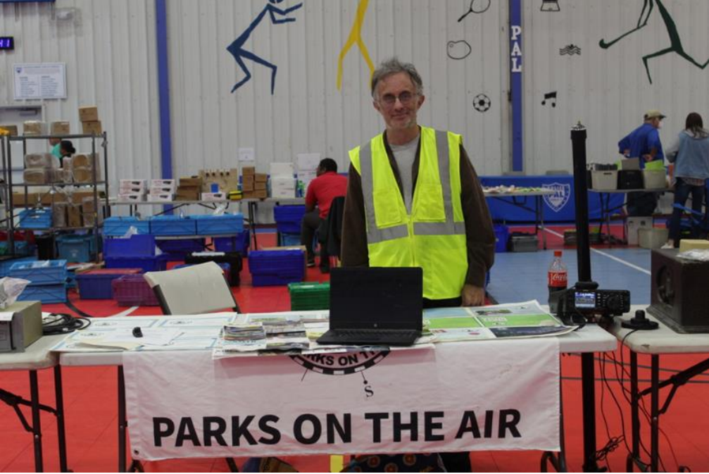
KB1ZAC promoting POTA at our CARA 2022 Hamfest.