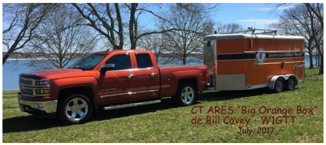
W1GTT's legacy: The CT ARES Region 4 "Big Orange Box" - aka Bob, and the W1SP Packet Network