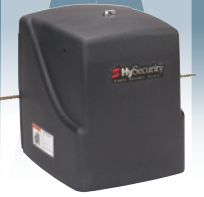
Slide Gate Operator

Ultra Reliable/Low maintenance • Variable speed • Easy, inexpensive installation • Solar