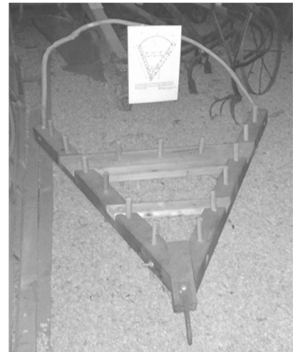
Harrow built by Howard on display at the Farmers' Museum.