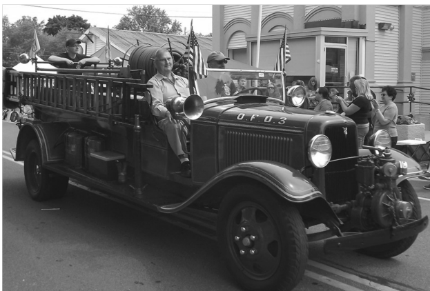
Fire trucks are always a hit in any parade, the Ovid Fire Department Truck in this years' parade, and a look back to a 1938 parade with the Interlaken Fire Department truck. Notice the old fire house in the background, and the covered sidewalks.