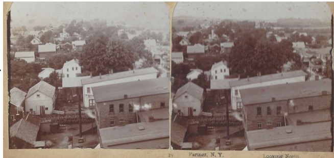
Pre-1904 Stereographic view looking North from the Baptist Church tower

The building is handicapped accessible. Refreshments will be served. In the event the school cancels after-school activities, check the Facebook page for updates, or call 607-280-2099.