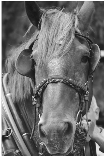
Left: Up close and personal with Jim Wilkins horse