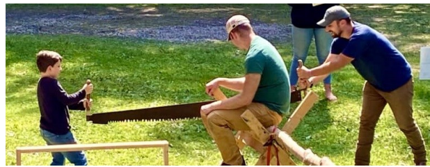
Among the hands-on experiences, learning to use a cross buck saw.

Volume 48 No. 2 October 2022 www.interlakenhistoricalsociety.org