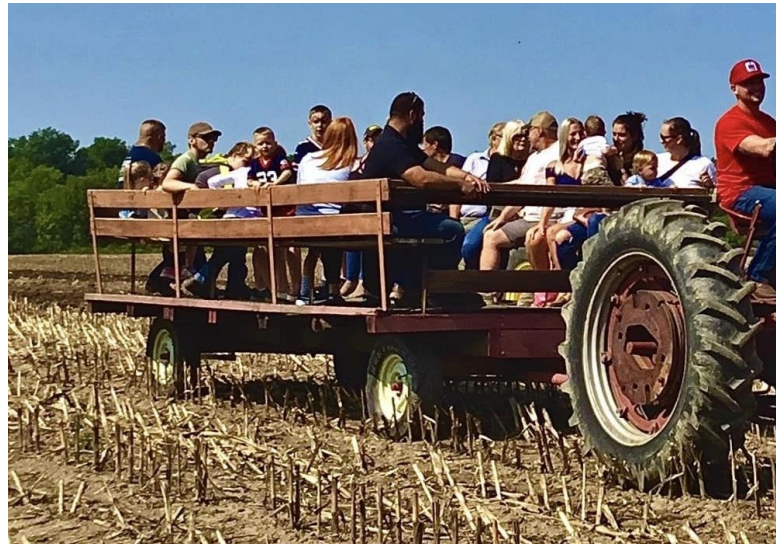
Top Row: Kids Tractor Pull, Alpacas, Churning Butter, Ox Bottom row: Meeting the Sheep, Wagon Rides for all, Walk