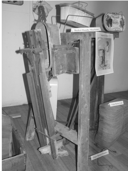
Grape Basket Handle Machine

Learn more about these machines in an upcoming Between The Lakes Historical Society Newsletter.