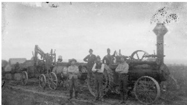
Threshing Machine with Steam Engine