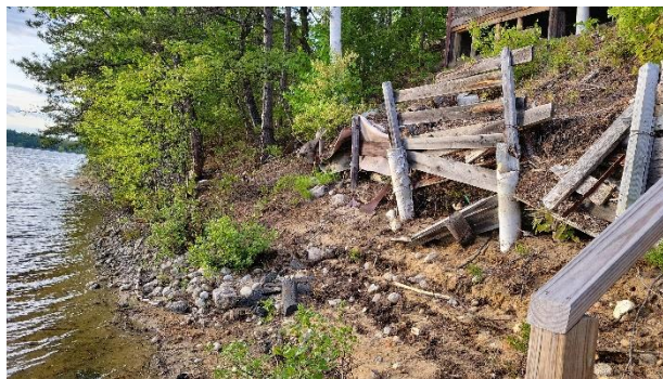
A steep eroding shoreline on Whitney Pond

The work on these sites is ongoing over the course of the two years of the project and has the potential for preventing more than 39 tons of soil erosion and 20 pounds of unnecessary phosphorus from entering our fragile lake ecosystem annually.