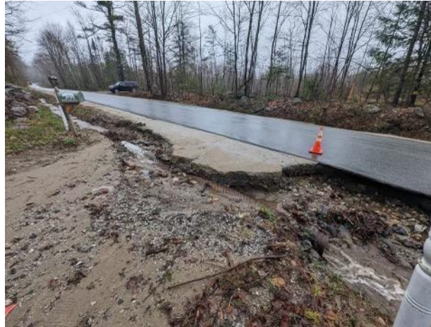
Rabbit Valley Road after a major spring storm

The most costly part of our project, with the potential for the largest impact in terms of tons of soil prevented from entering Hogan and Whitney Ponds involves the more technical work of large abatement projects. Many of these sites also involve collaboration with the project's environmental engineer to ensure that BMPs are carried out in the remediation process.