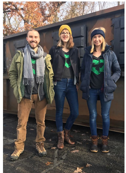
The team celebrating America Recycles Day.