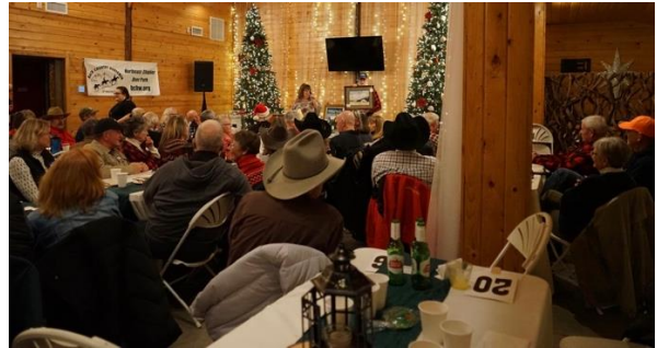
Lots of people... beautiful centerpieces