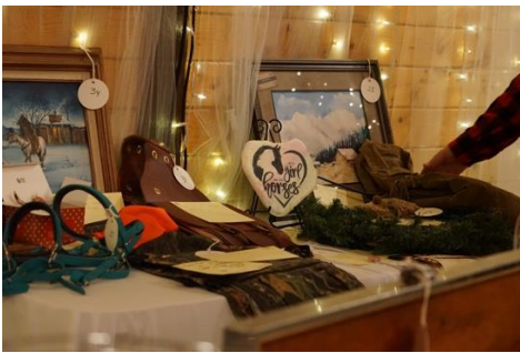
Closeups of items...