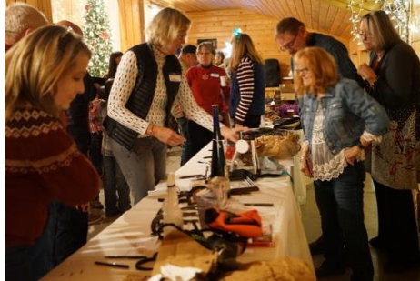
Looking over the silent auction items...