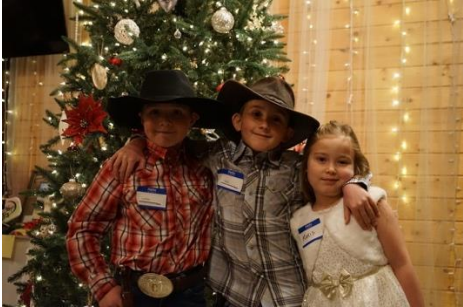
These are our new future cowboys & cowgirl! Aren't they the cutest things ever?

Few snap shots...more to come next month. Looks like everyone had a good time!