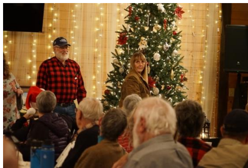
Who's the model? Our post president, of course... nice western leather jacket!