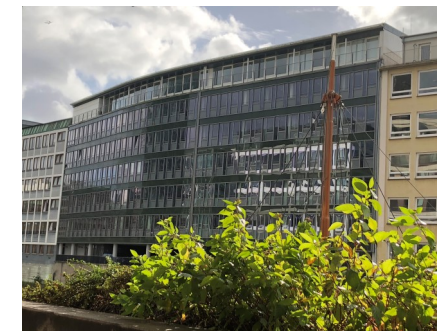
SECO headquarter in Hamburg

Since 1873 SECO has been trading between Japan and Germany. Japan has left its mark on SECO and made us internalize important business virtues: quality management, precision, flexibility and vision. Remaining true to these standards in the development of RuXXac has led to a successful and sustainable business.