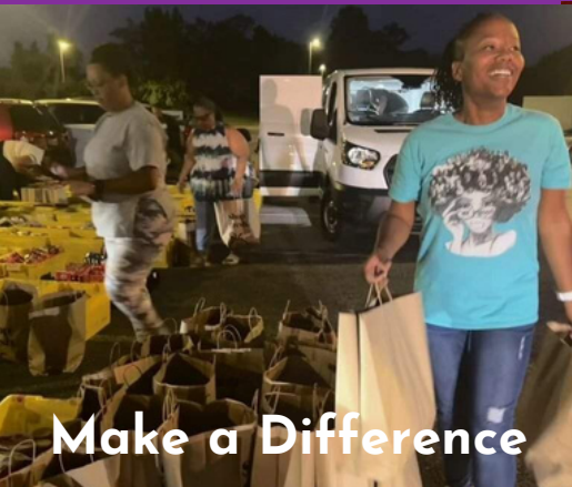
Make a Difference