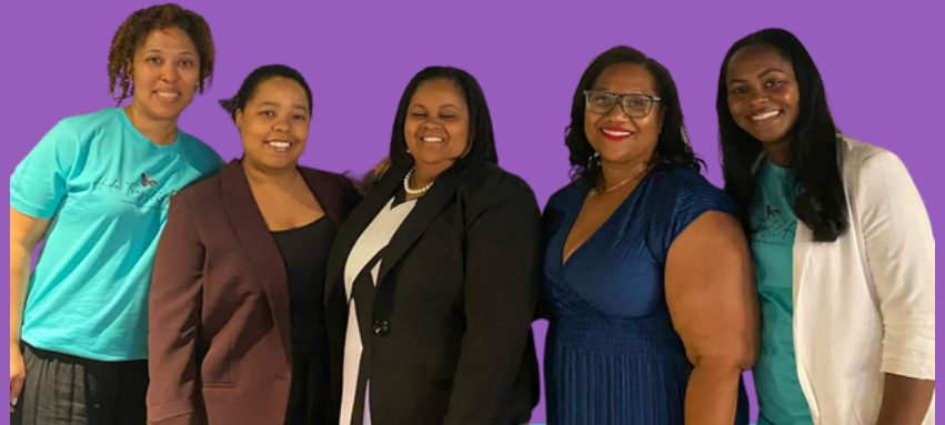
Trezher Tribe Volunteers

3 Support the goals of each event through effective volunteer participation.