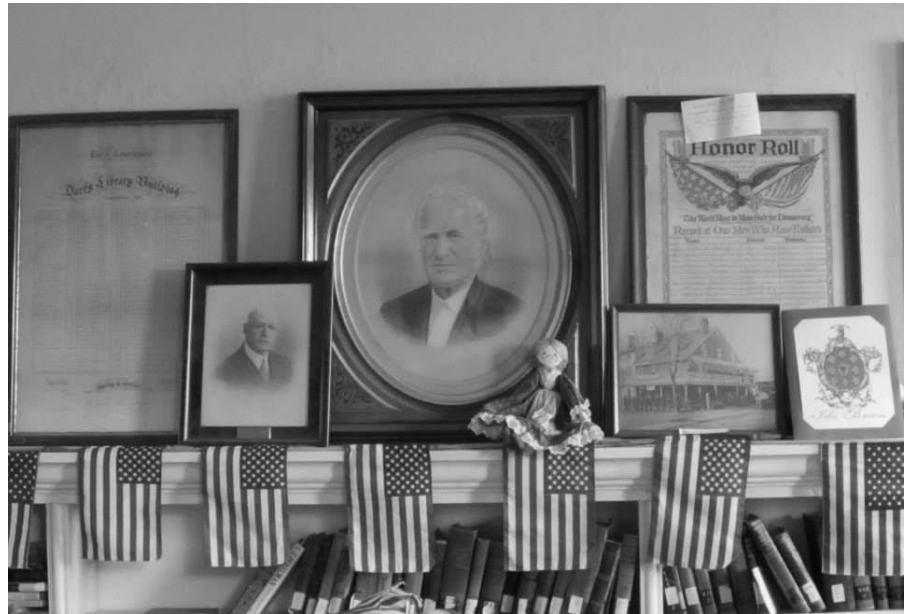
Display of local historical items that need cataloguing at the Darby Free Library.

If you'd like to volunteer or have questions about the project, please contact the Aldan Democrats at 610-626-6074.