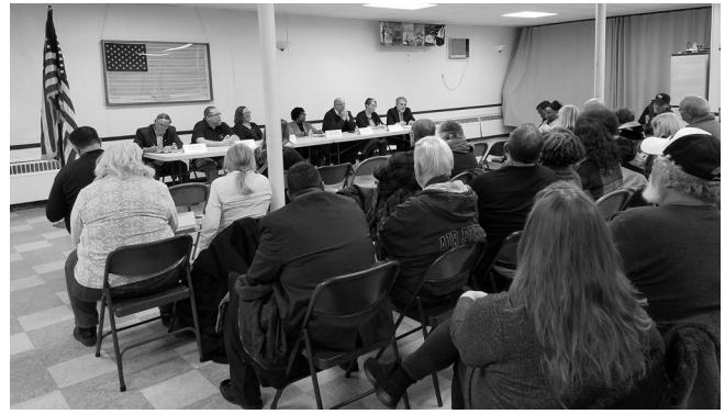
Community members meeting the incoming 2020 Aldan Borough Council at the American Legion.