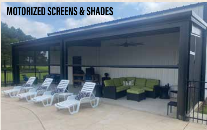
MOTORIZED SCREENS & SHADES

FINANCING AVAILABLE | 12 MONTHS INTEREST FREE