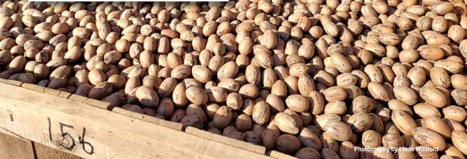
Photography by Linda Williford